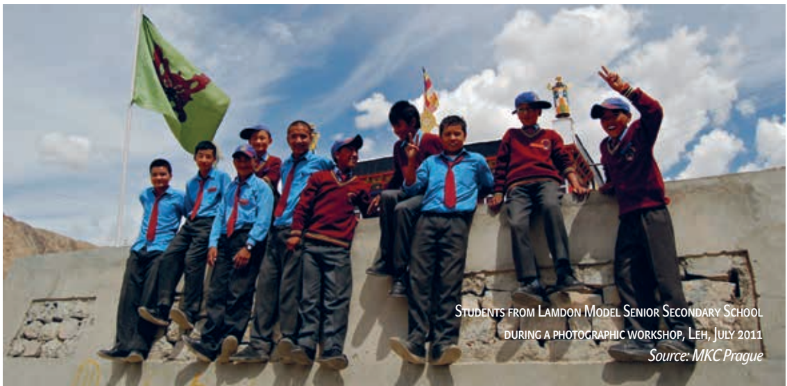
STUDENTS FROM LAMDON MODEL SENIOR SECONDARY SCHOOL DURING A PHOTOGRAPHIC WORKSHOP, LEH, JULY 2011