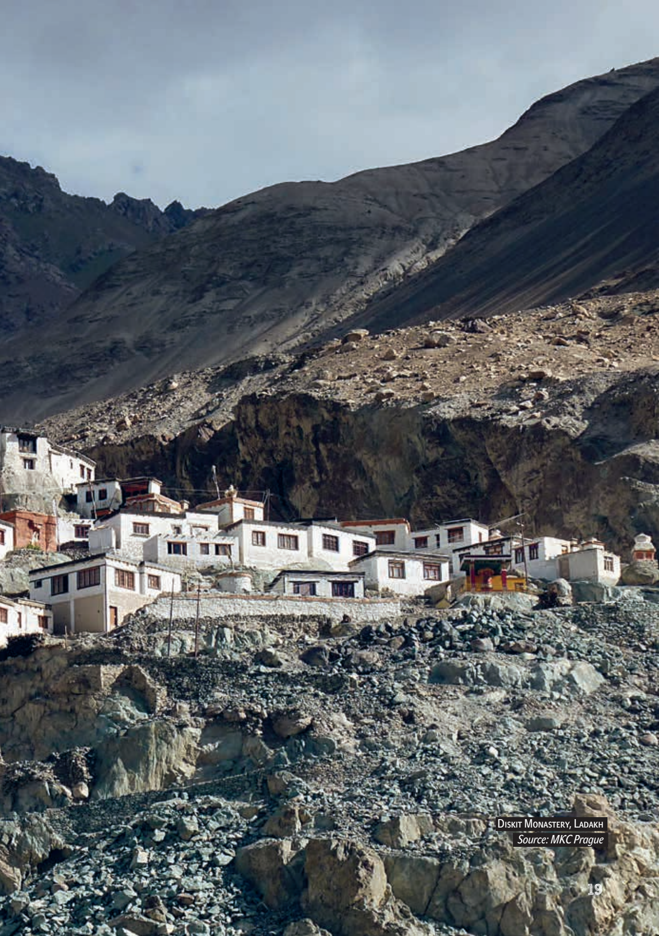
DISKIT MONASTERY, LADAKH