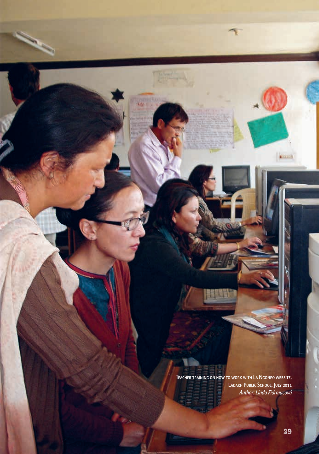
TEACHER TRAINING ON HOW TO WORK WITH LA NONGPO WEBSITE, LADAKH PUBLIC SCHOOL, JULY 2011