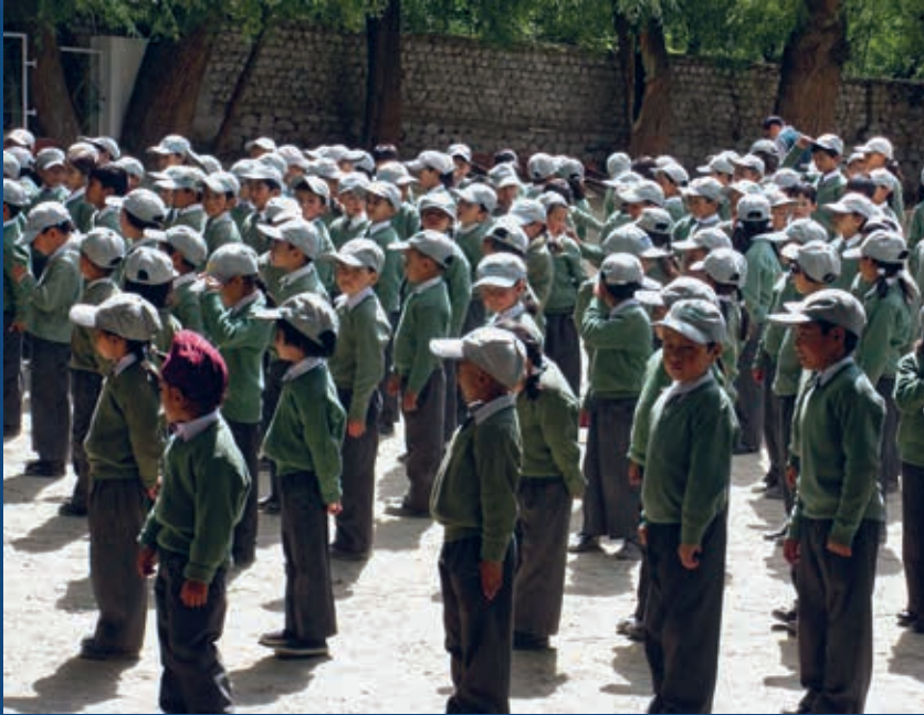
MORNING ASSEMBLY AT MORAVIAN MISSION SCHOOL IN LEH, JULY 2010

If you want to learn more about this project, simply go to www.la-ngonpo.org and find plenty of interesting information.