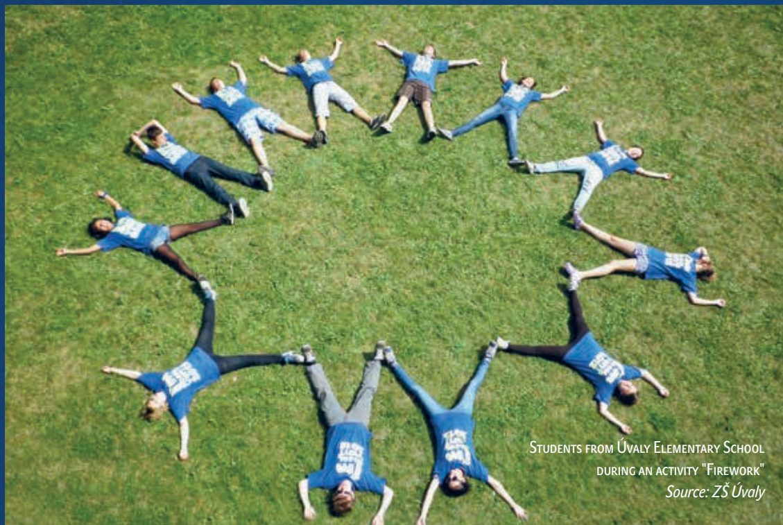
STUDENTS FROM ÚVALY ELEMENTARY SCHOOL DURING AN ACTIVITY "FIREWORK"