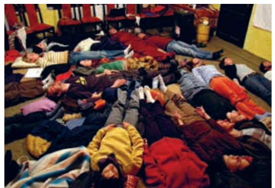
LA NONGPO EXHIBITION IN LEH, THE CAPITAL OF LADAKH, JULY 2012