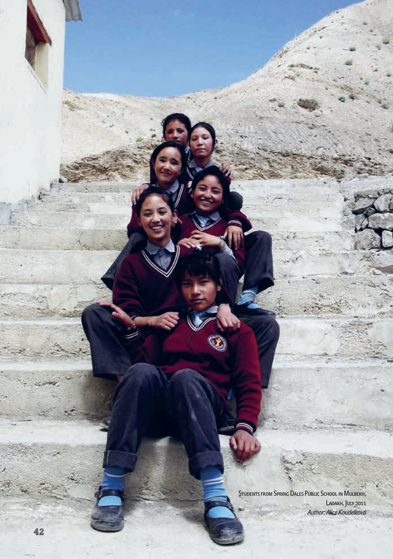
STUDENTS FROM SPRING DALES PUBLIC SCHOOL IN MULBEKH, LADAKH, JULY 2011 Author: Alice Koudelková