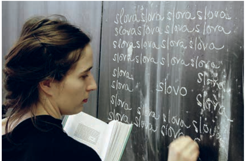
LA NONGPO LESSONS IN ÚVALY ELEMENTARY SCHOOL