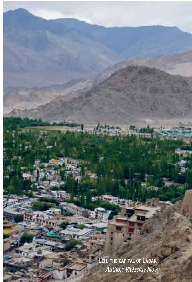
LEH, THE CAPITAL OF LADAKH Author: Vítězslav Nový

Barley is the staple food used for traditional ngam- phe (barley flour mixed with tea), but you'll find potatoes, beets, carrots and peas on the fields as well. As for fruits, different variation of apricots it is: freshly picked from the tree, sundried, added to lassi (refreshing yoghurt drink) or in the form of homemade jam.