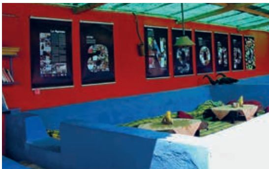
LA NGONPO EXHIBITION IN LEH, THE CAPITAL OF LADAKH, JULY 2012