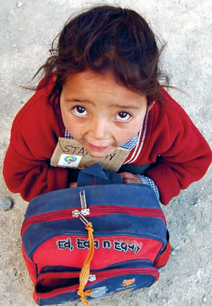
A LITTLE STUDENT AT SPRING DALES PUBLIC SCHOOL IN MULBEKH, 2011 Author: Blanka Ježková