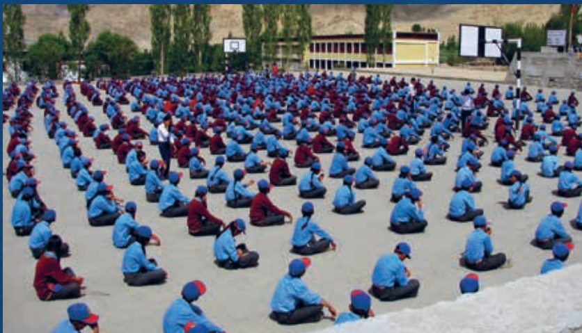
MORNING ASSEMBLY AT LAMDON MODEL SENIOR SECONDARY SCHOOL,