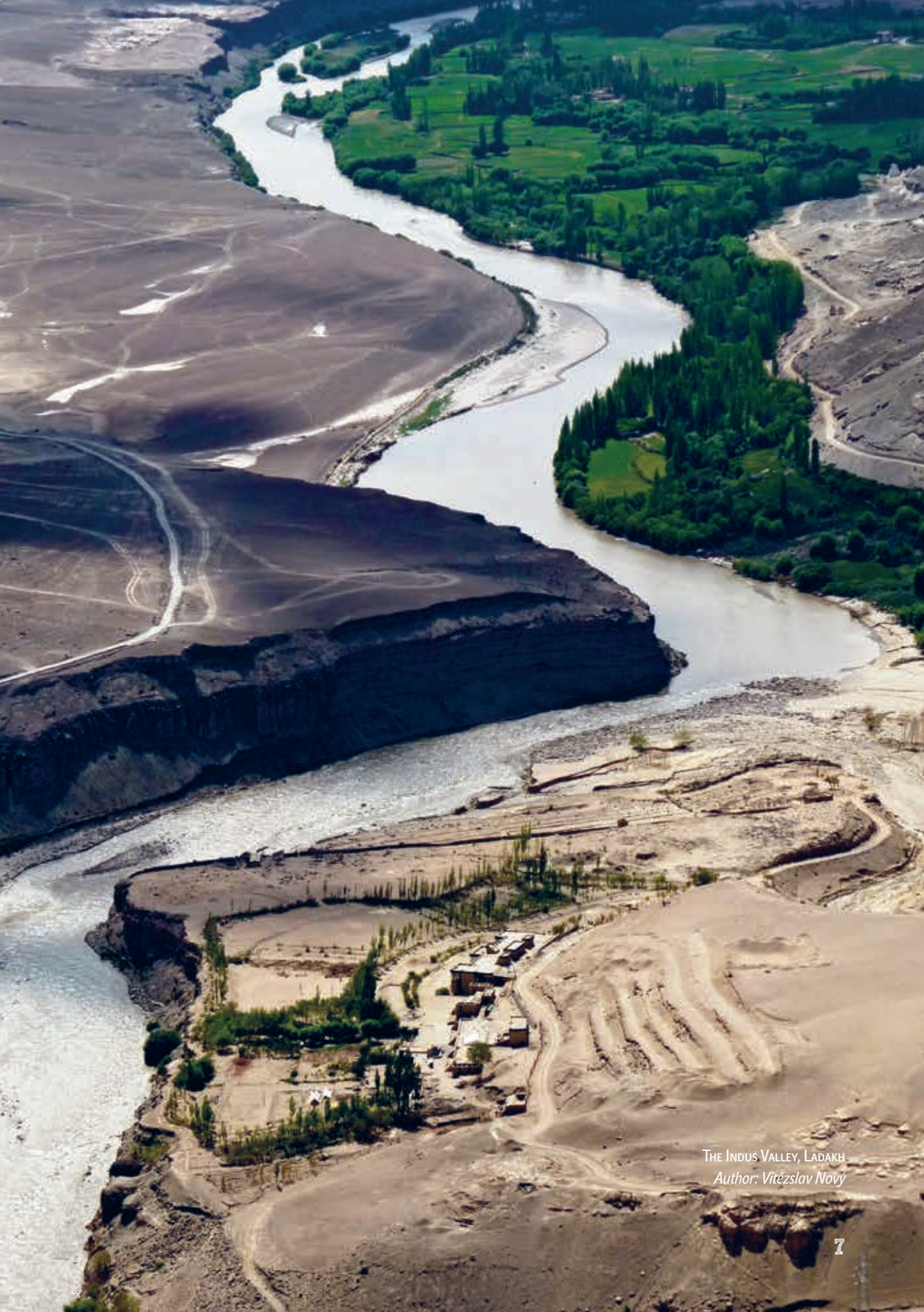
THE INDUS VALLEY, LADAKH Author: Vítězslav Nový