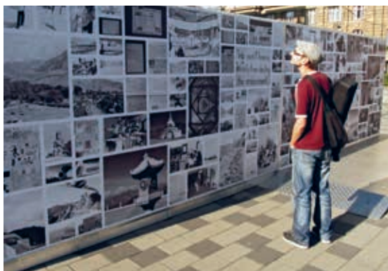
THE LA NGONPO TOURING EXHIBITION IN BRNO, CZ, SEPTEMBER 2012

Then, the exhibition moved to Prague where it could be seen in the upper part of the Wenceslas