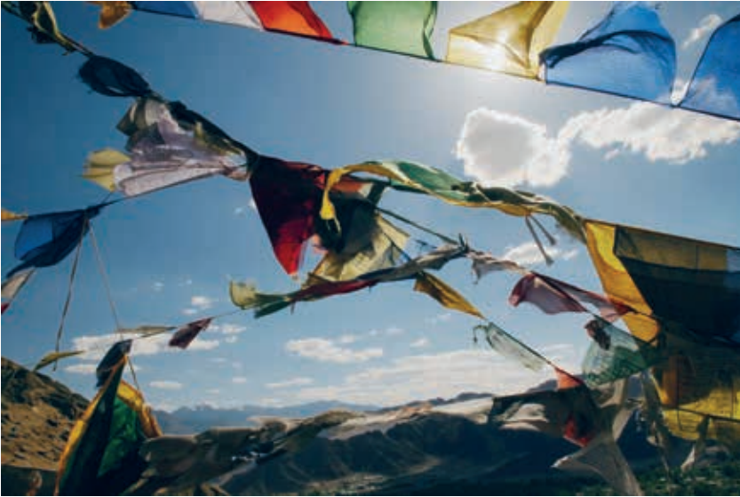
PRAYER FLAGS ARE A TYPICAL FEATURE OF LADAKH

However change is coming to Ladakh or Little Tibet as it is often called. Television, internet, mobile phones and other modern accessories have big impact on today's generation. With the arrival of globalization, family togetherness and traditional values are slowly being replaced by modern way of living so typical of Western society. But deep inside people remain friendly, humble and tolerant - it's their way of life.