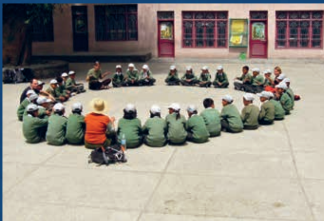
A PROGRAM PREPARED BY CZECH VOLUNTEERS AT MORAVIAN MISSION SCHOOL IN LEH, JULY 2010