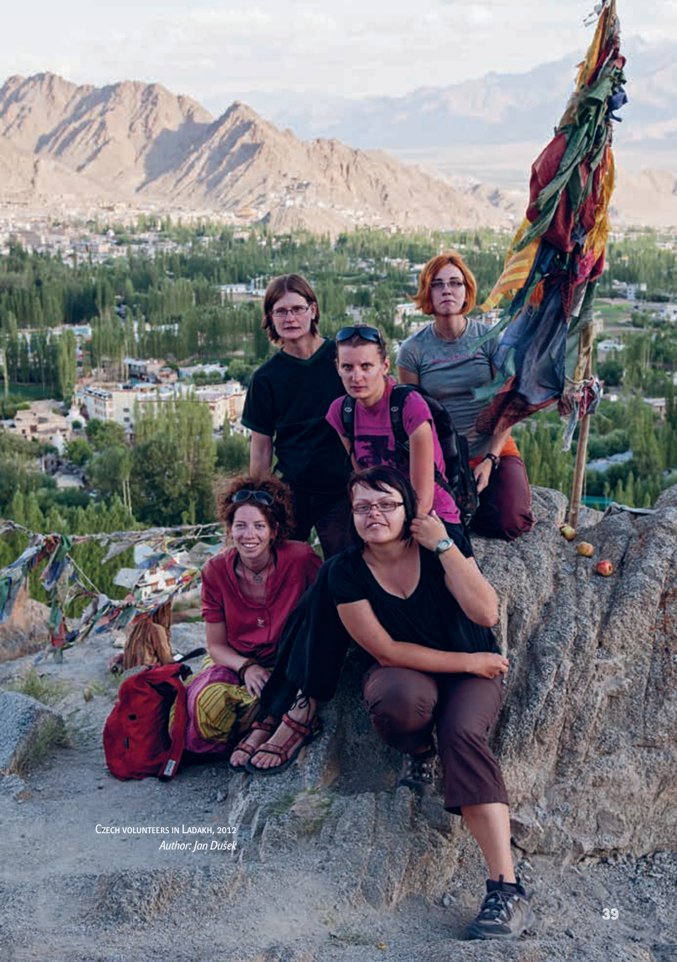
CZECH VOLUNTEERS IN LADAKH, 2012