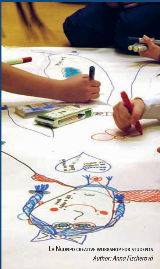
LA NNGONPO CREATIVE WORKSHOP FOR STUDENTS