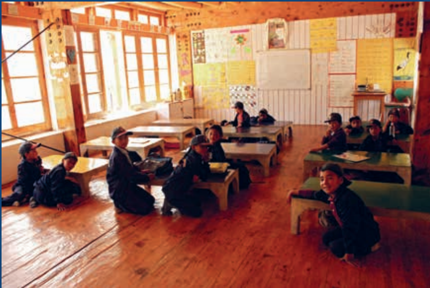
STUDENTS OF DRUK PADMA KARPO SCHOOL, JULY 2012

Czech volunteers are helping to implement the project in India, and a group of Indian teachers involved in the project is coming to the Czech Republic at the beginning of June.