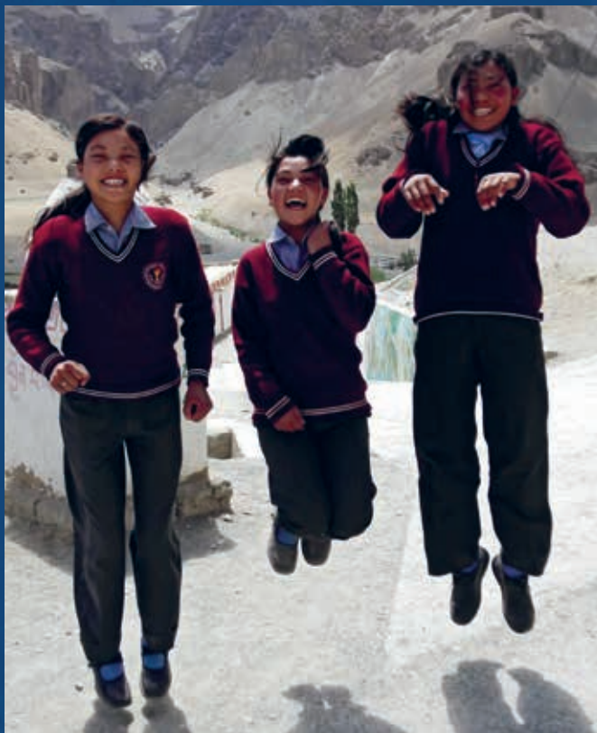
STUDENTS OF SPRING DALES PUBLIC SCHOOL IN MULBEKH, 2011

know (and do not play) Minecraft. Unfortunately, the drug abuse exists in Nepal as well as it does in the Czech Republic. We could also learn from their flowers (activity focused on learning about one's self) that they are very self-disciplined and wish to become writers, cardiologist.