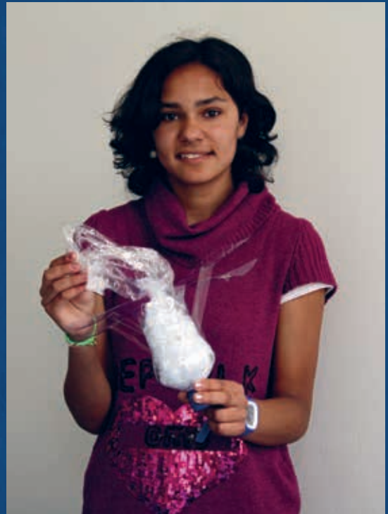
STUDENTS FROM ÚVALY ELEMENTARY SCHOOL DURING LA NGONPO LESSONS