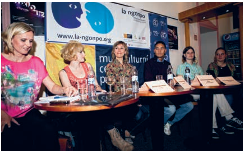
LA NONGPO EXHIBITION IN LEH, THE CAPITAL OF LADAKH, JULY 2012