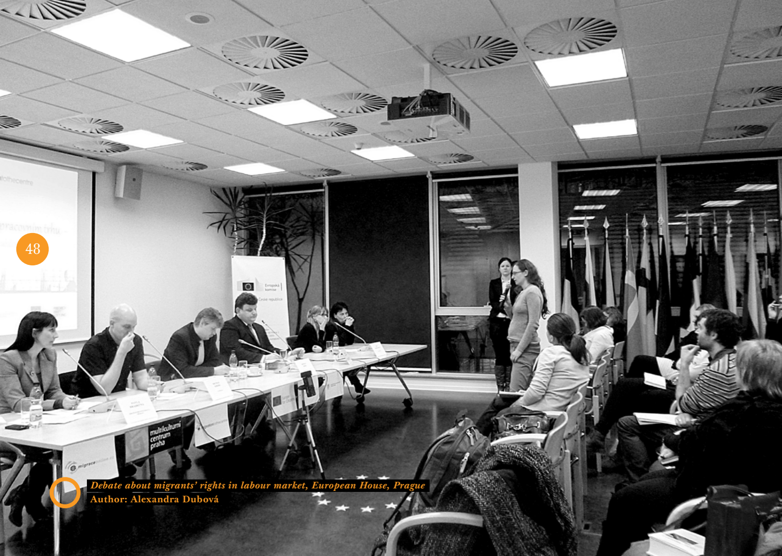
Debate about migrants' rights in labour market, European House, Prague Author: Alexandra Dubová

In November 2012, a two-day meeting of coordinators from all partner countries was held in Prague; the fundamental themes of the project and the forms of outputs of the project were settled, and also a workshop on media work with migrants was held.