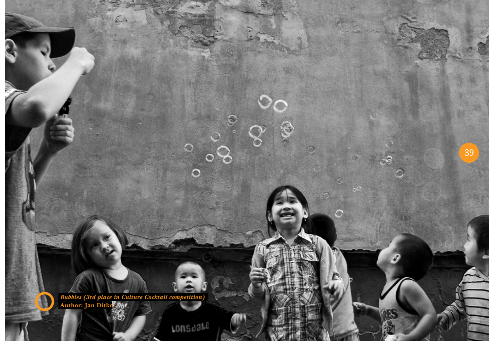
Bubbles (3rd place in Culture Cocktail competition)

To learn more, visit the Get Involved section of our website or write an e-mail to: infocentrum@mkc.cz .